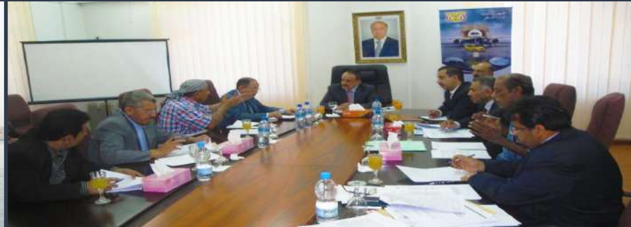
Cabinet approves the solution results for the status of the shipping workers at the port of Mukalla