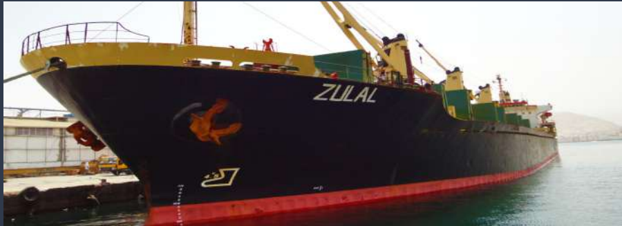
Offloading 58,146 tons of stone coal via Mukalla seaport

NEWSLETTER ISSUED BY YEMEN ARABIAN SEA PORTS CORPORATION