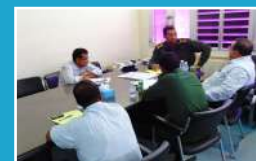
The Head Chief of Hadhramout Security met with the leadership of the Corporation of the Yemen Arabian Sea Ports to discuss the security issue at the port of Mukalla