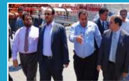
Ambassadors of Foreign Countries Visit The Corporation and Peruse its Maritime activities