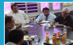
Foreign investment companies visit Yemen Arabian Sea Ports Corporation are introduced to its activities